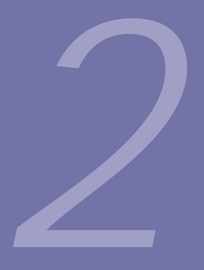
The legal context